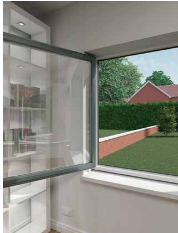
≡ Tilt and Turn window Triple-glazed